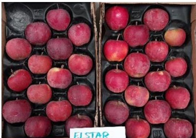
Sunelstar (left) compared to Valstar (right) – same orchard, same age, same harvest date

Elstar clone with a high level of coloration, even during hot summers, and above all early coloration, allowing 70% to be harvested on the first pick.