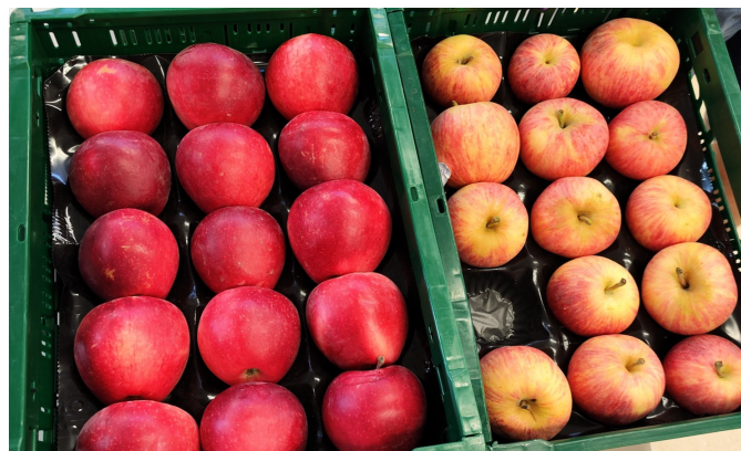
Left, Stellar® and right, standard Gala, in Mas Badia, Spain (same orchard) in 2022